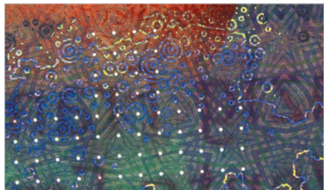
Swiss bank note